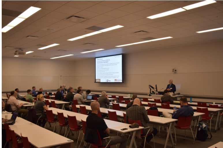
Workshop Venue and Participants

The vision for this first Workshop and additional workshops within the five-year PtD Initiative is that they become a significant linchpin for enhancing the dialog about PtD, inspiring and fostering research into PtD, improving implementation of PtD concepts, helping to build momentum in education and training, and ultimately leading to improved safety performance in the workplace