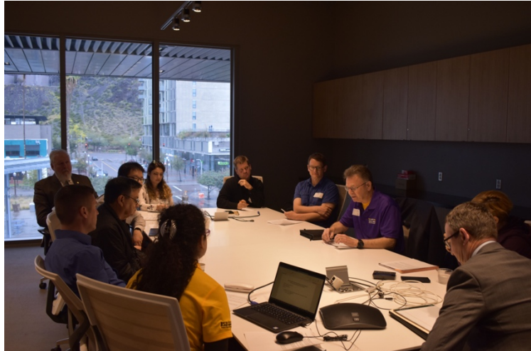
Breakout Group

The breakout groups provided the following overarching guidance and thoughts. Researchers should work closely with industry participants and industry-oversight teams, enabling connectivity and effective communication between researchers and owners/contractors. They also should target industry sectors with high ownership input and influence