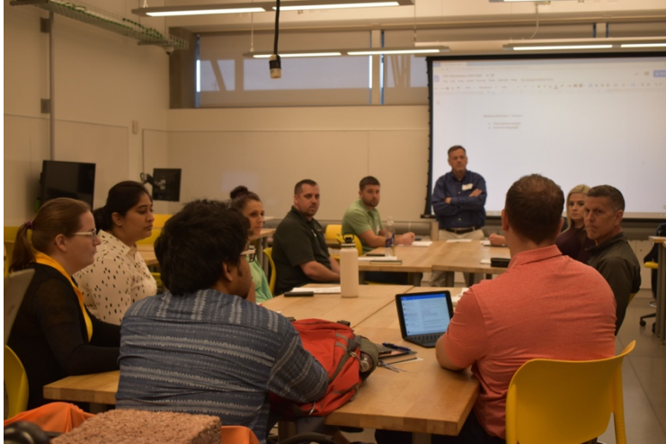
Breakout Group