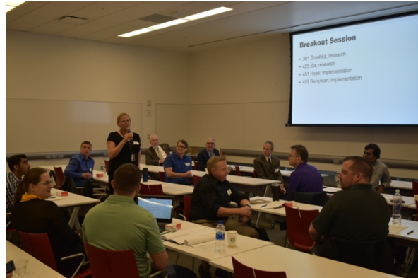
Active participation from attendees

The day wrapped up with a summary of key thoughts and learnings from this first PtD Workshop. It was clear from the enthusiasm generated during the event that gatherings of informed and interested safety professionals and academics, such as this Workshop, are important to help move the goal of improving PtD on projects and products forward. Details of the presentations and breakout sessions are provided in previous chapters. Some of the key issues to consider across research, implementation and education include: